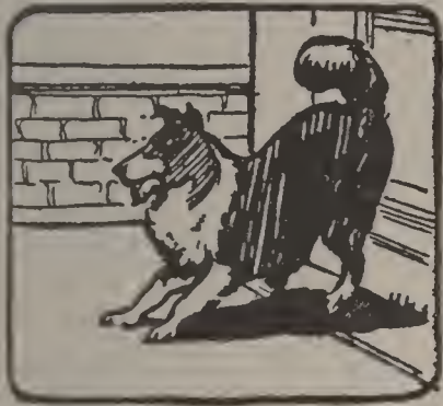
He Leaped Out of the Window.

“WELL, daddy, we’re all ready for our story. What’s it going to be about to-night?” exclaimed Jack and Evelyn as daddy came into their room.